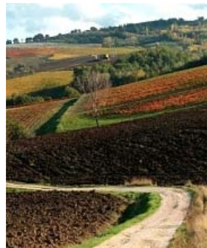
The Sagrantino road to Montefalco

The vineyards are facing South East in a natural amphitheater. The Soil is a mix loam and clay with a strong presence of calcareous pebbles and stones. The vines are planted with an average density of 1600 vines per acre. The vineyards are about 20 years old with some of them reaching the 50 years; the trellis systems used are the cordon spur for reds and bilateral guyot for whites. All vine growing and wine making processes avoid any use of pesticides and artificial practices. Only in extreme situations (due to weather and or disease) low doses of copper and sulfides are sprayed. Napolini winery though is not associated with any organic or biodynamic certification board.