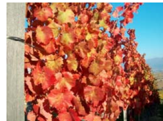
Sagrantino vines at harvest time all leaves are red!

Reds: all the typical varieties of Umbria region like Sagrantino , Sangiovese , Montepulciano di Abruzzo and Ciliegiolo are grown. These are used to make the Rosso di Montefalco . Same varietals with some merlot are used to make their Rosso dei Monti . Of course Napolini makes as well a straight Sagrantino a very important varietal that is indigenous from Montefalco.