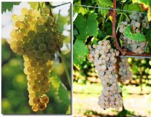
Grechetto Colli Martani – Trebbiano Spoletino

Cultivars: Napolini's main white varietal used is the Grechetto Colli Martani . This varietal is quite strong and has good production levels, ripens relatively early making wine of medium to high alcohol with full flavor and good acidity. When used in blends, it adds perfume, flavor and structure to the wines. Grechetto is used to make the Vigna di Clara and is one of the varietals used as well for the Bianco dei Monti together with Tocai Friulano and Chardonnay, Trebbiano Toscano and the Trebbiano Spoletino . The latter one is a genetic mutation of the trebbiano family, which is very late maturing yet, brings up a lot of structure in terms of acidity and sugar content.